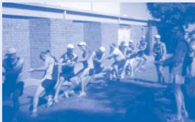
TUG-O-WAR: STRAINING UNTIL YOU THOUGHT YOU WOULD BURST