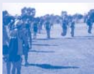
SACK RACING: IT'S HARDER THAN IT LOOKS