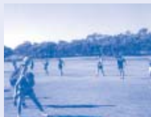
WETTER IS BETTER: ATTEMPTING TO CATCH A WATER BALLOON FROM A DISTANCE... HOW WILL THIS HELP ON THE FOOTY FIELD?